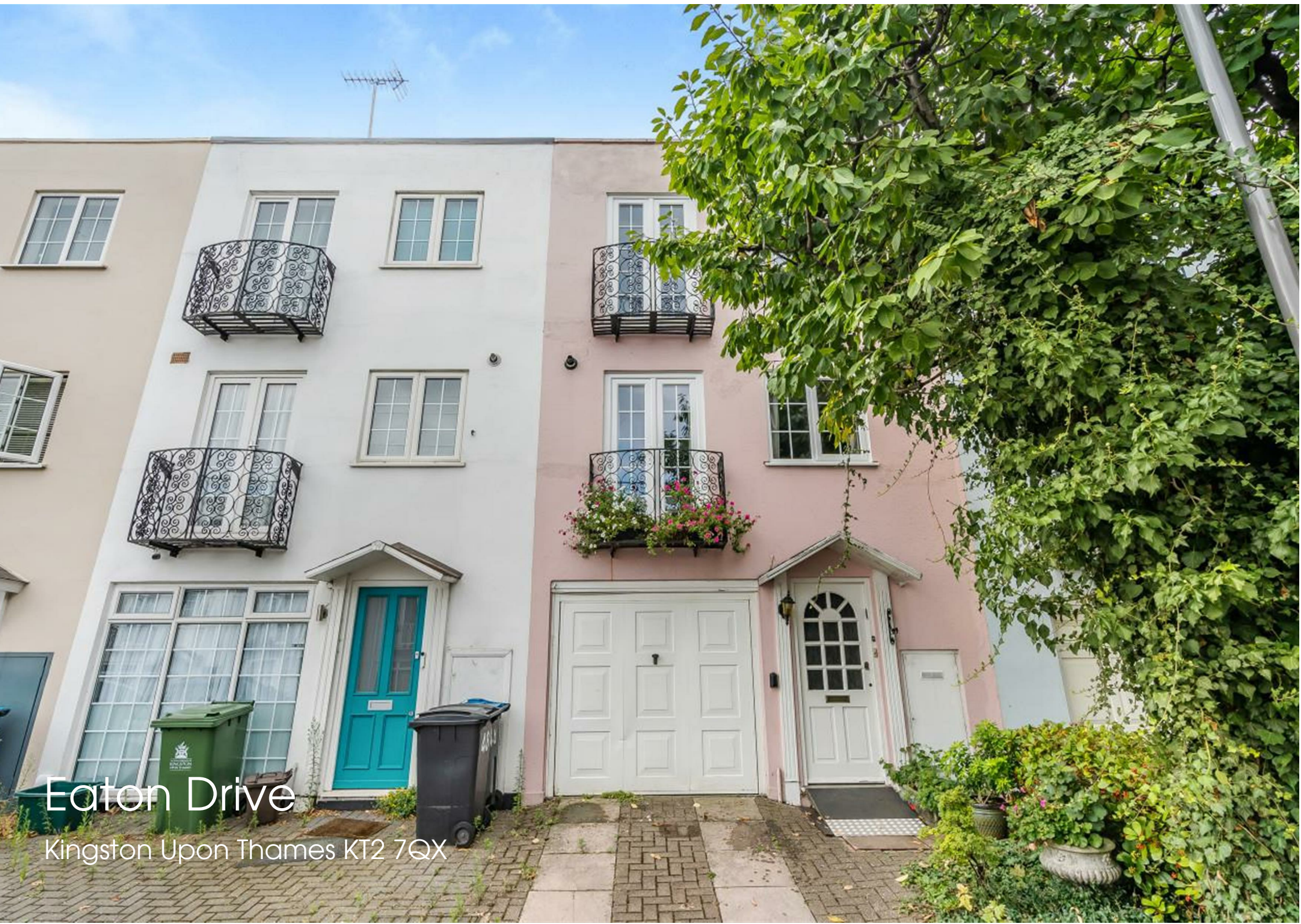
Eaton Drive Kingston Upon Thames KT2 7QX

34 Richmond Road Kingston upon Thames Surrey KT2 5ED www.gibsonlane.co.uk Tel: 020 8546 5444